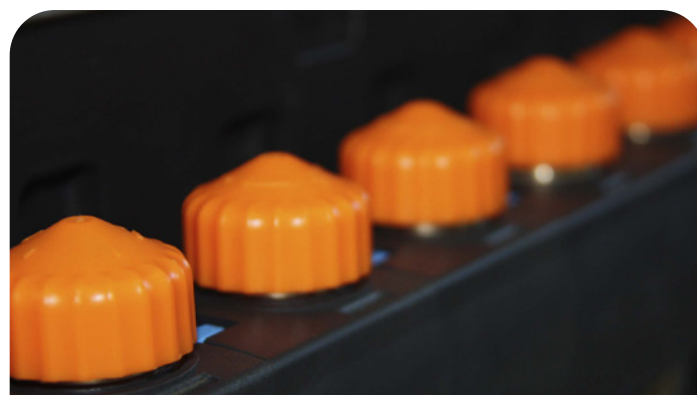
Manifold equipped with innovative AFC technology